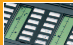
▲ Labels you can customize. Large transparent key tops

Programmable system or user keys are available on the Alcatel Reflexes™. Labeling can be standardized at a corporate level and/or user-defined. Determining the status of a call is simple with the help of easy-to-understand icons that replace the confusing sequences of LED combinations. The label associated with each key is easy to read because the key top is equipped with a built-in lens that magnifies the key label. This key top is a patented Alcatel feature.